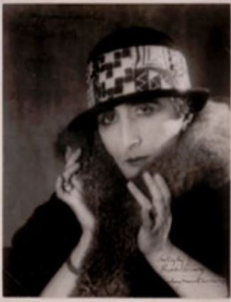
Figure 1 Marcel Duchamp, Rrose Sélavy , photograph by Man Ray, 1921

Duchamp, the anti-artist, has always fascinated me to the point of envy. His irreverent behavior and ground-breaking ideas were so engaging that they force me to rethink my work and its purpose. His work is humorous to the passerby yet far more intelligent than any work of its time. The idea, rather than the product, was his focus. He was the greatest, laziest person ever.