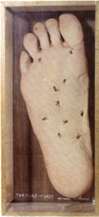
Figure 2. Marcel Duchamp Torture-Morte 1959

Painted plaster and flies, on paper mounted on wood, 11 5/8 x 5 5/16 x 2 3/16 inches (29.5 x 13.4 x 10.3 cm)