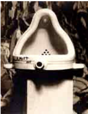
Figure 8 Marcel Duchamp, Fountain , 1917