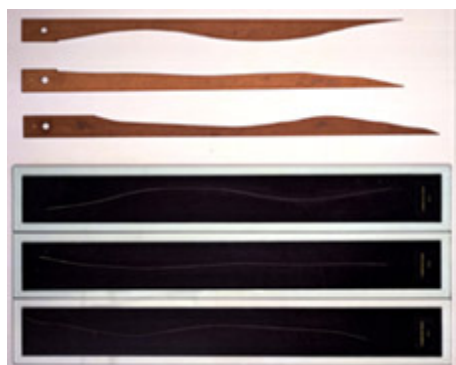
Figure 7 Marcel Duchamp, Three Standard