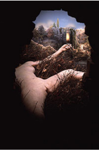
Figure 9 Marcel Duchamp, Given: 1. The Waterfall / 2. The Illuminating Gas, 1946-66

This statement sounds odd given the very abstract nature of his work and the high degree of misinformation Duchamp has provided over the years about it. Simply considering the many variations of the Fountain (Fig. 8) incident, (15) and the degree to which he was unwilling to provide any information about Etant Donnés (Fig. 9) during his lifetime (16) suggests that he may be providing yet more misinformation about his work and working process. Yet, these comments are suggestive considering the kinds of problems his instructions present in their implementation. They are an illustration of the difficulty which abstractions present to communication: to return to the luggage physics problem, how do we approach measuring the “dirty shirt”? While a clean and a dirty shirt do present different, individually understandable aspects, the problem is not one of clean or dirty shirts, but of deciding how to proceed with measuring them. Any measurement would either be provisional or, more likely, incomplete and contingent—an approximation based on several different measurements, as the Three Standard Stoppages refer to the meter and present approximations of the meter, but not the actual meter itself.