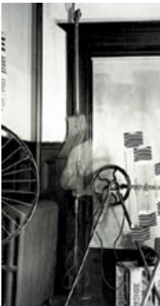
Figure 6 Marcel Duchamp, In Advance of the Broken Arm , 1915 (Studio Photograph)

What is notable about this description is the way that it does not mention any of the typically significant characteristics of readymades: their arbitrariness, their lack of aesthetic